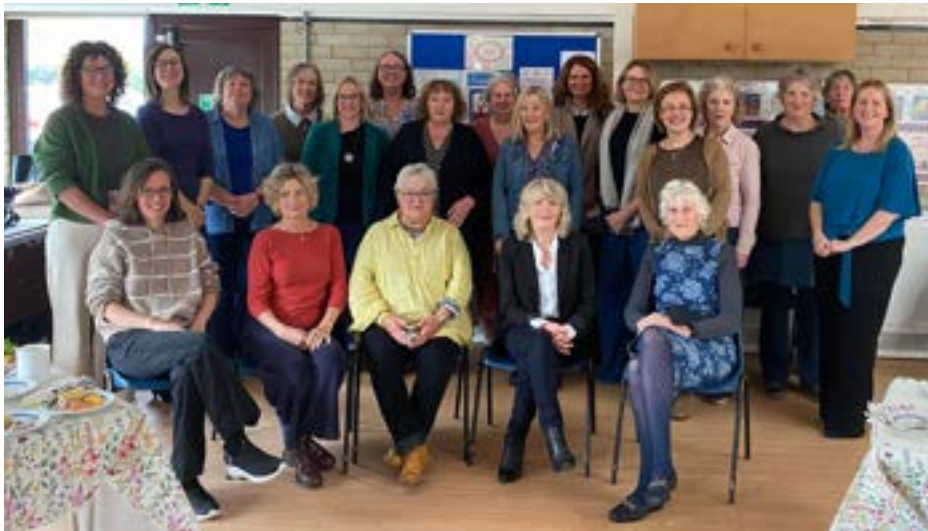
The team now (most of)!